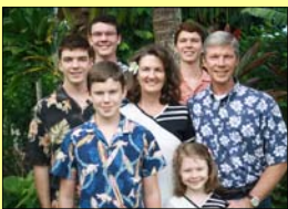
The English Family

Monthly Supporting Congregations & Organizations