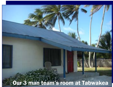
Our 3 man team's room at Tabwakea

Further grounding new Christians in the faith through daily Bible teaching and training