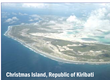
Christmas Island, Republic of Kiribati

G reetings to each of you, our dear co-workers in the proclamation of the Gospel of Jesus Christ! It is with great joy that we write to you today from this outpost in the Pacific Islands. While time may have forgotten these remote villages, God's people have surely remembered them in the furtherance of His Gospel!