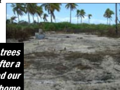
Ashes and charred trees were all that was left after a wild fire destroyed our Christian brother's home

A sister in Christ recently lost her husband. Another sister's baby died. A brother's home was recently destroyed by fire. Christians are not strangers to hardships...none of us. Through our daily in-depth studies of God's Word (Job and Acts), we're seeing and helping others to learn how God's people suffered persecution, problems, hardships, trials of every kind....and yet remained faithful to Him. What a blessing it is to continue in the work of God in the face of great trials and tribulations! We're helping new Christians to be grounded in the faith through teaching solid Bible reasons for their faith in Christ ("Why I am a member of the church of Christ"). Thank you for entrusting this great work of God to us. We look forward to sharing with you more about this important time of teaching and training as we progress over the next few weeks here in the Republic of Kiribati.