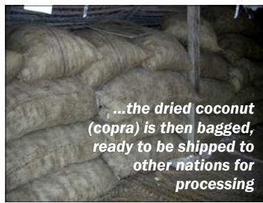
...the dried coconut (copra) is then bagged, ready to be shipped to other nations for processing

(above) Drying the "meat" of the coconut is required. The moisture content is closely monitored before bagging