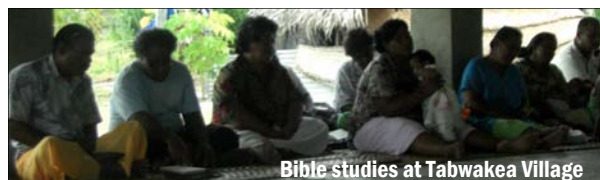
Bible studies at Tabwakea Village

A s we landed at Cassidy Airfield this past Wednesday, within minutes we were met by local Christians, the joy of which continued throughout the first day and even into the night at various homes throughout this island. After meeting with leadership from each of the two congregations of the Lord's church, it was determined that our teaching efforts would begin with a 3 hour combined assembly each night for two weeks. This would allow us to use daytime hours for personal studies and visitations. We are excited to share with you that our Bible classes are now well underway, with attendance and participation increasing steadily. It's very encouraging to labor with Christians and friends who have a genuine interest in learning and obeying the scriptures.