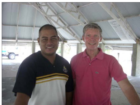
We are blessed to be working this month with Boata and other faithful men who are glorifying God