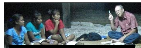
Teaching to strengthen the 22 new Christians. Some are being persecuted for their new faith.