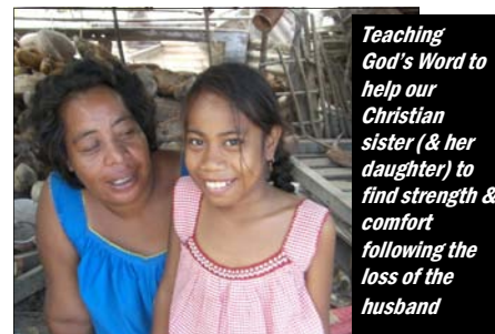
Teaching God's Word to help our Christian sister (& her daughter) to find strength & comfort following the loss of the husband