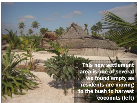
This new settlement area is one of several we found empty as residents are moving to the bush to harvest coconuts (left)